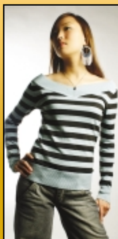
Twice the Style