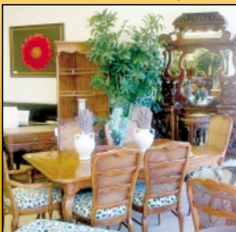
Melange Etc. Fine Consignment