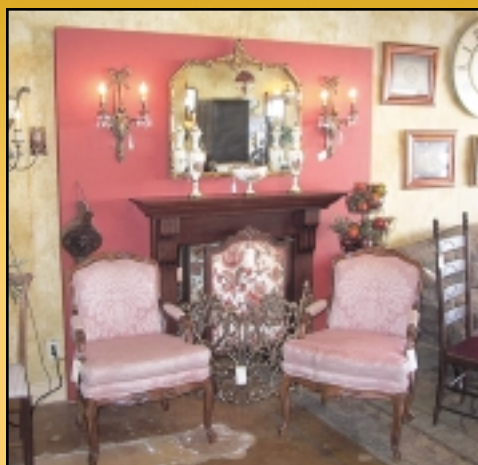
Sarah Whitcomb Antiques