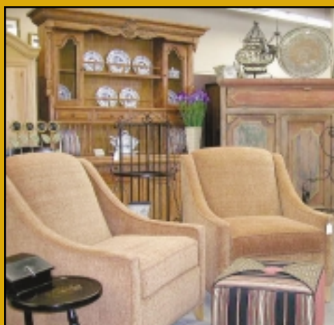
Full House Furniture Consignment